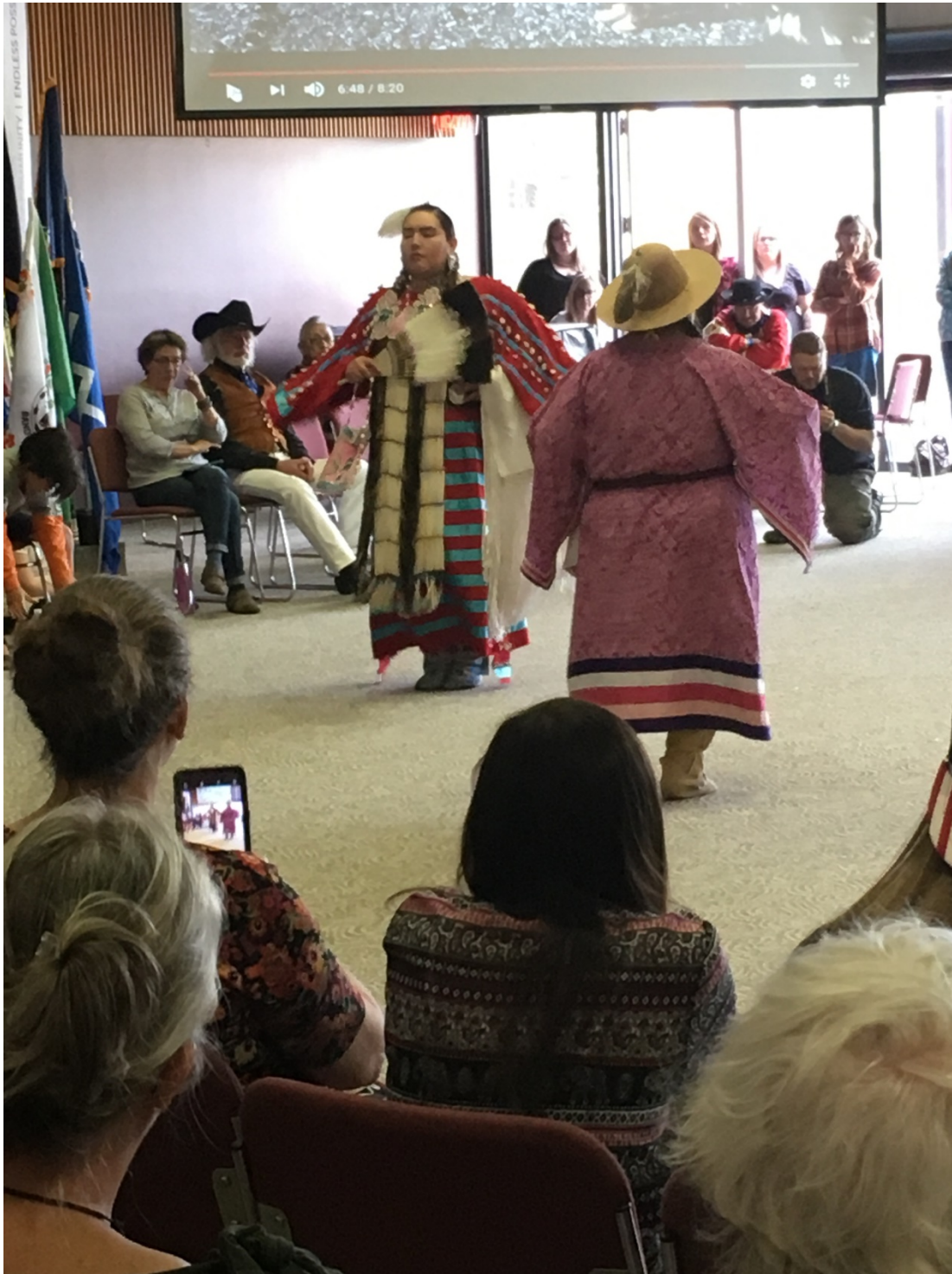
Photo File Name: FVCC TRIO_MAIS 2 Powwow 2018 Photo Caption Exhibition dancing, FVCC, 4-28-18