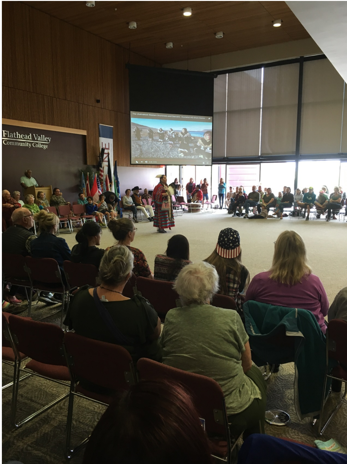
Photo File Name: FVCC TRIO_MAIS 1 Powwow 2018 Photo Caption Exhibition dancing, FVCC, 4-28-18