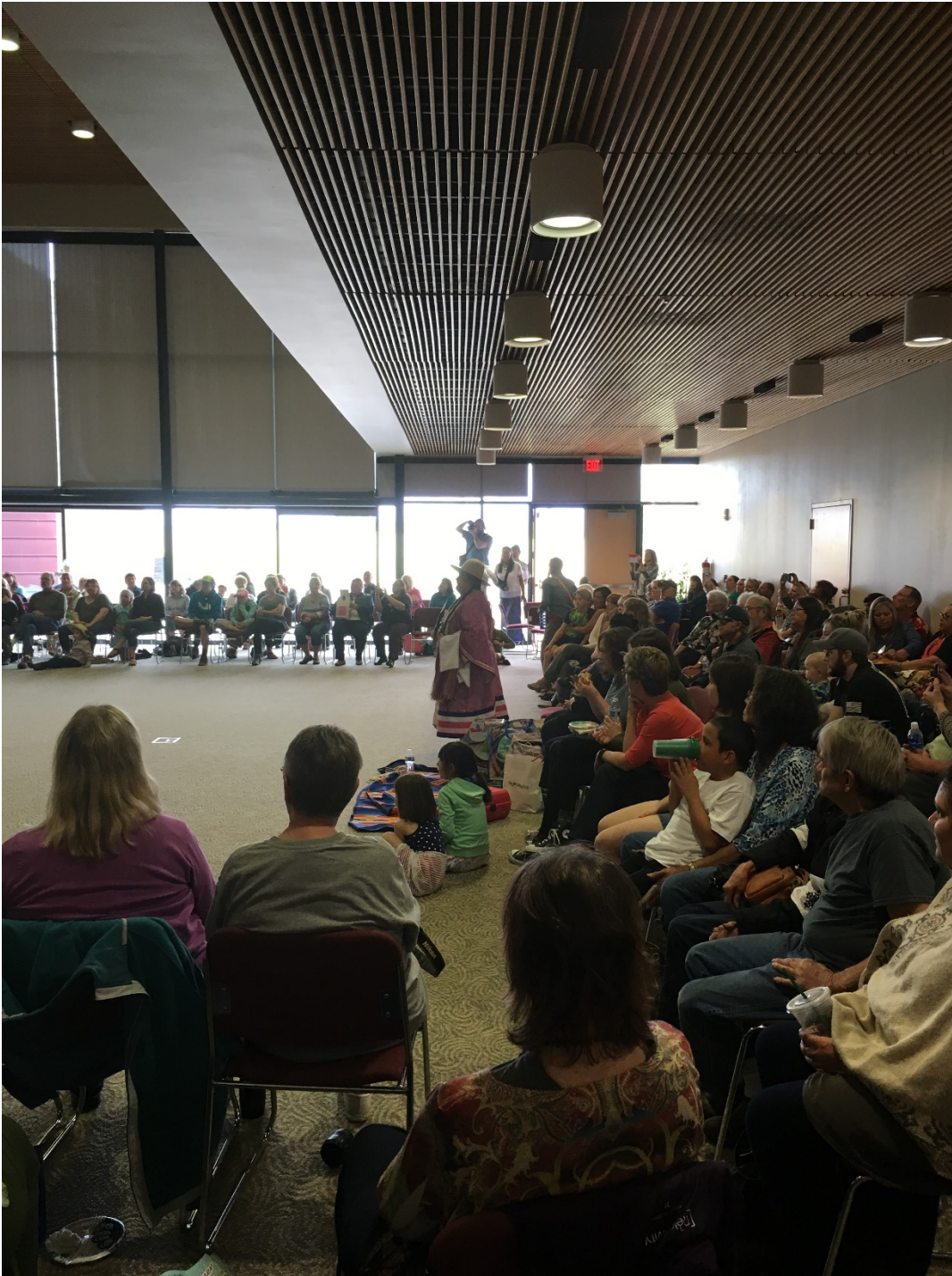
Photo File Name: FVCC TRIO_MAIS 3 Powwow 2018 Photo Caption Audience for Educational Powwow FVCC, 4-28-18

12. Do you have any suggestions on how to improve the Governor's Tribal Relations Report? None