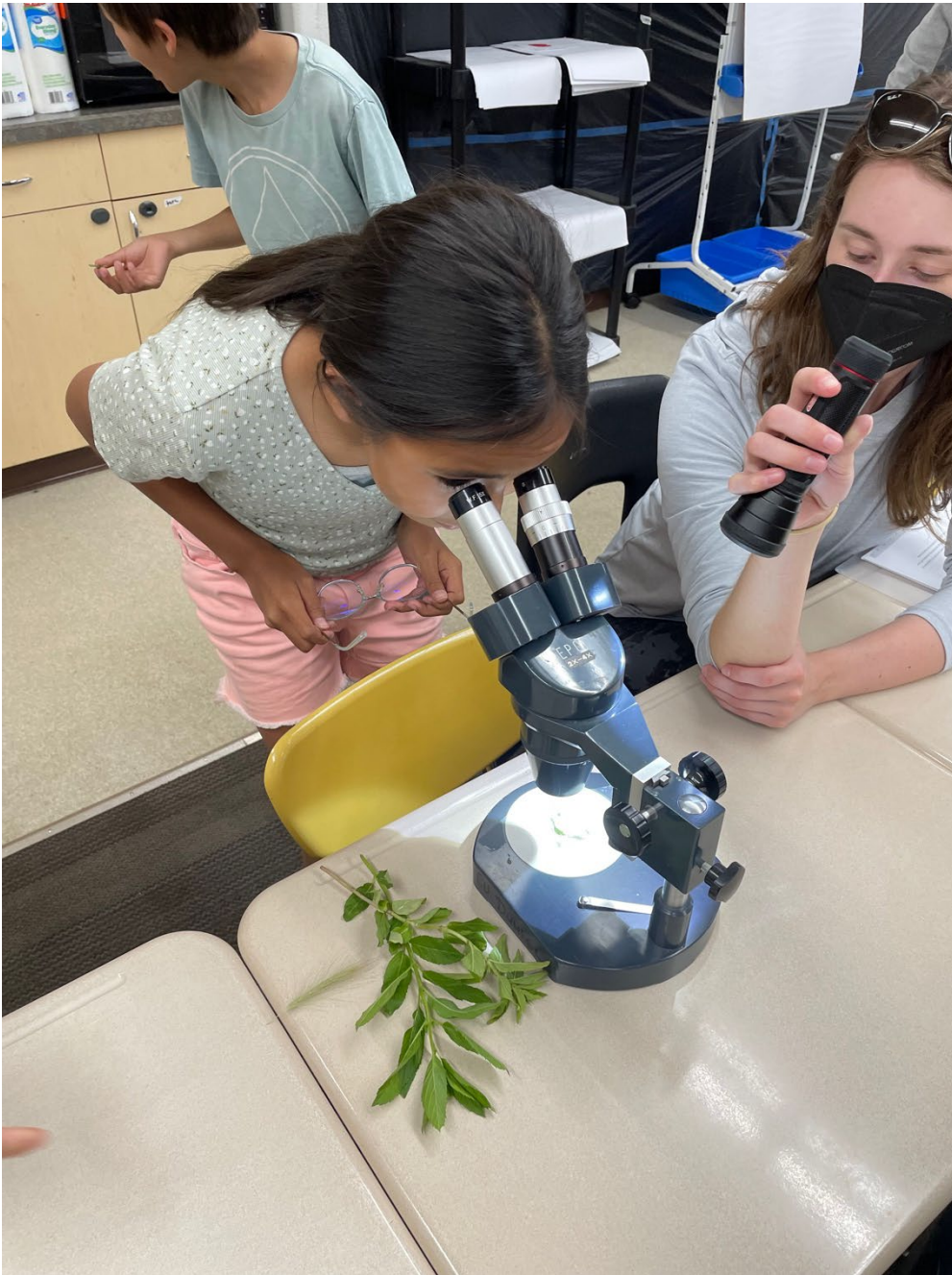
Student examining mint plant under microscope

2. Do you have any suggestions on how to improve the Governor's Tribal Relations Report?