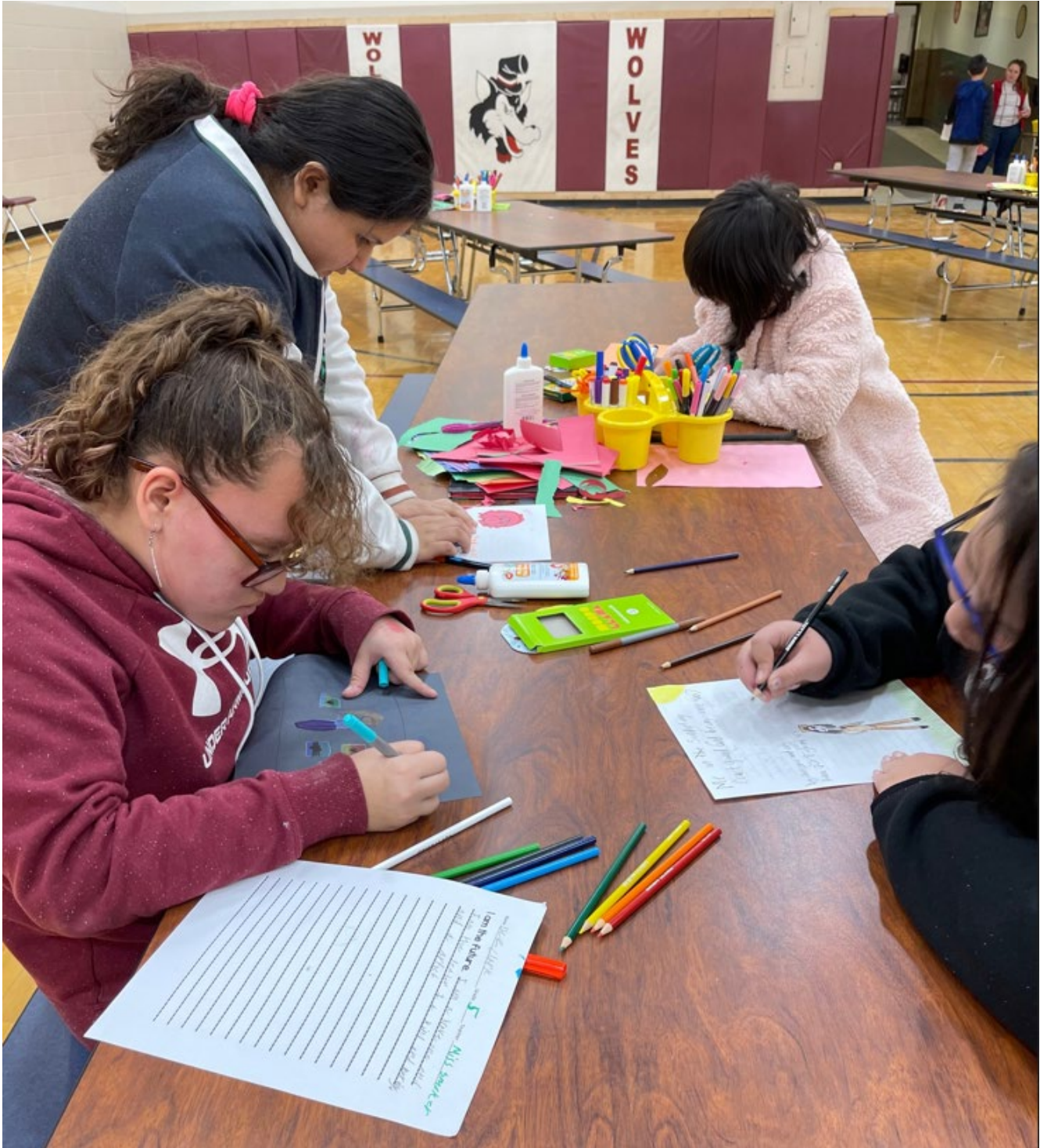
Photo File Name: 5 th Grade children expressing their ideas through art Photo Caption (include the name of the event/persons, location, and date): Monthly HEART activity at Northside School