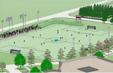
VIEW OF FIELD FROM ROOF OF EXISTING COT HOULDING