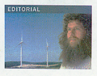
Dear prospective customers and friends!

installation and service tasks in complementary seminars. In the first phase, the factory in China will be designed for an annual production of 240 wind turbines of type FL 2500. Completion of the construction work at the Sherryang site in the province of Lipping is scheduled for the middle of the year.