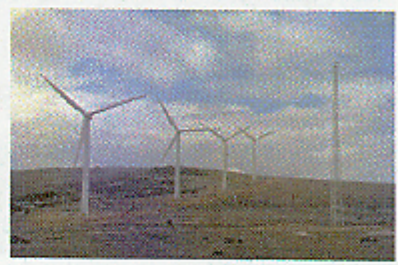
With this FL 1250 wind park South Africa enters into the exploitation of modern wind energy technology