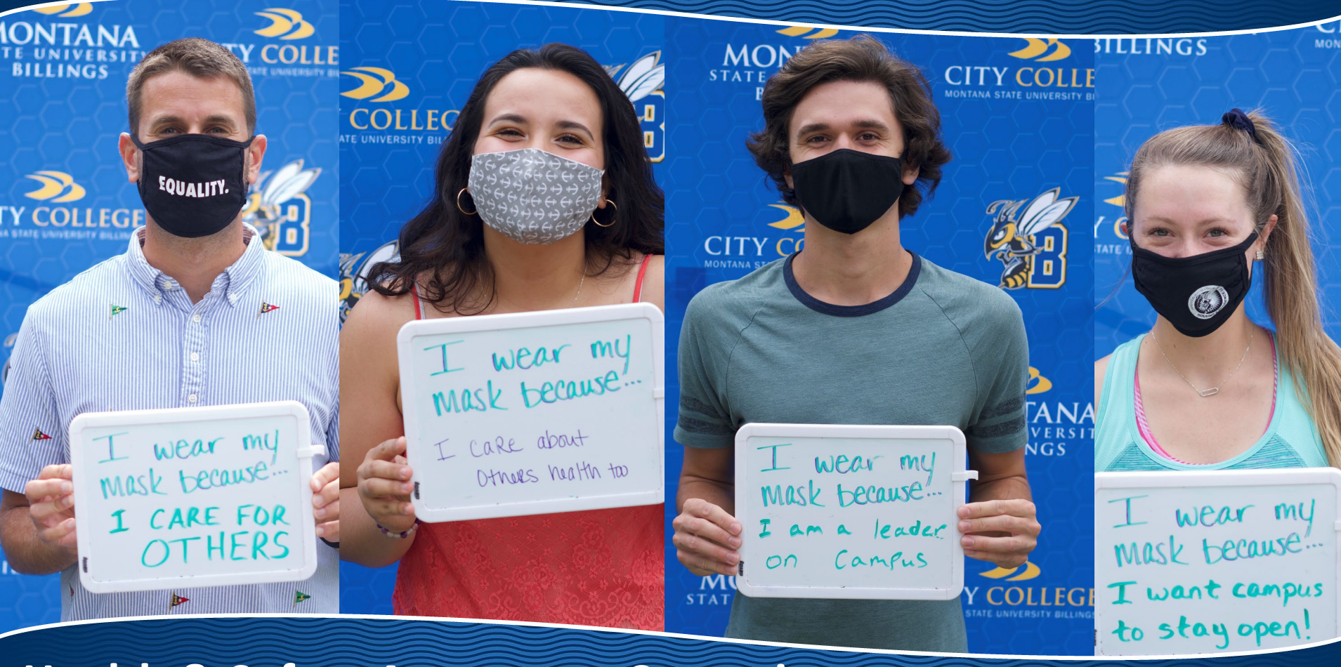
Health & Safety Awareness Campaign