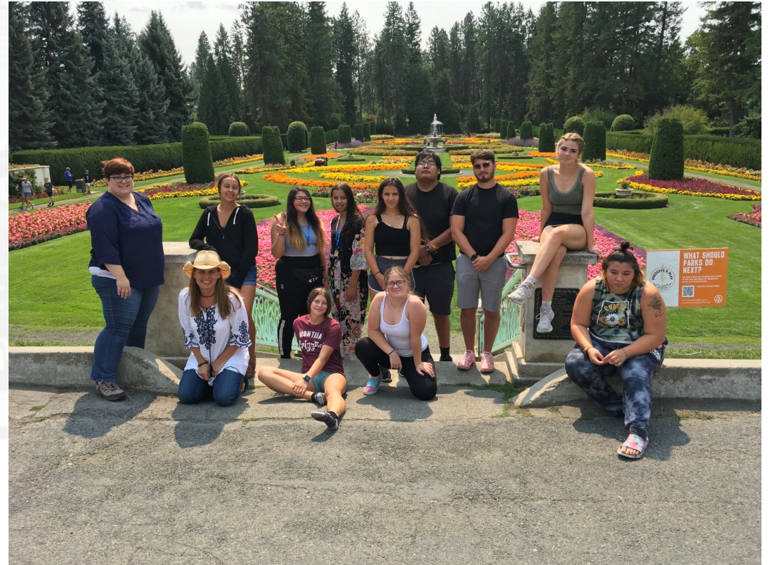
Campus and Career Exploration August 2021