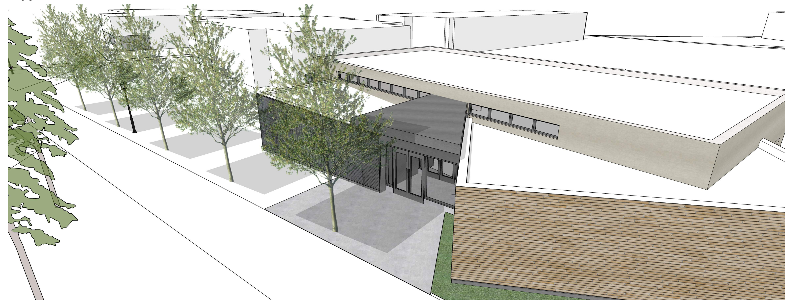
1 AERIAL VIEW AT MAIN ENTRY A0.01 1" = 400'-0"