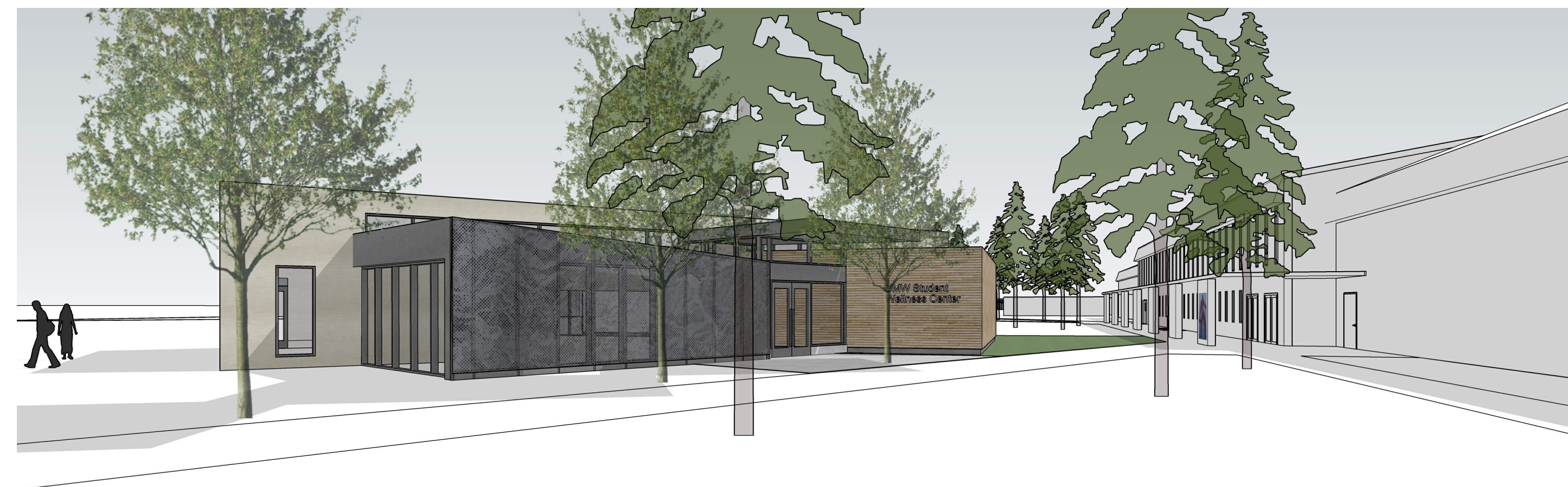
2 VIEW FROM SOUTH A0.01 1" = 400'-0"