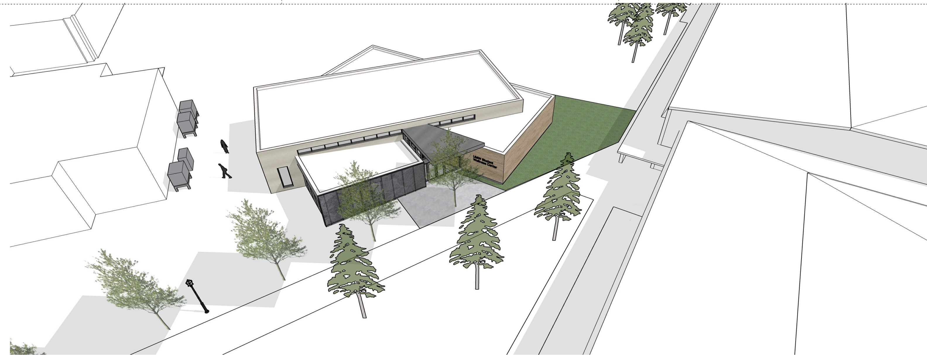
3 AERIAL VIEW FROM SOUTH A0.01 1" = 400'-0"