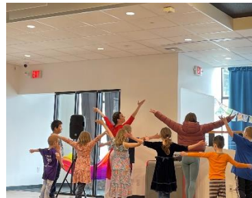
Figure 7 Dance Lesson