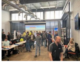
Figure 4 APC Career Fair