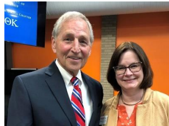
Figure 9 Gov. Racicot & Dean Bauman