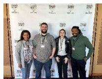
Figure11 HC TRIO Leadership Conference Participants