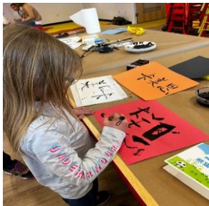
Figure 6 Student writing her name in Chinese