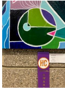
Figure 1 Special Award Ella Stoddard, Artist