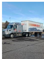
Figure 5 CDL Tractor Trailer with HC Logo