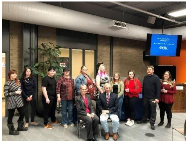
Figure10 PTK Inductees