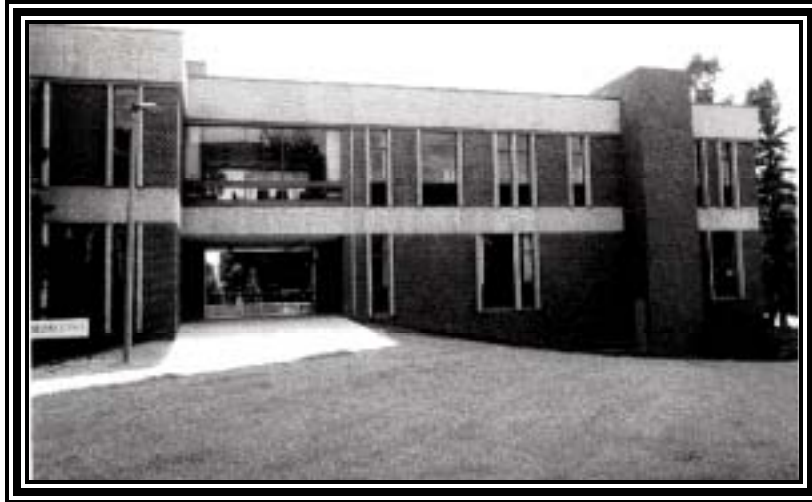
Sherrick Hall – Constructed 1973 College of Nursing Gross Area 18,300 s.f.