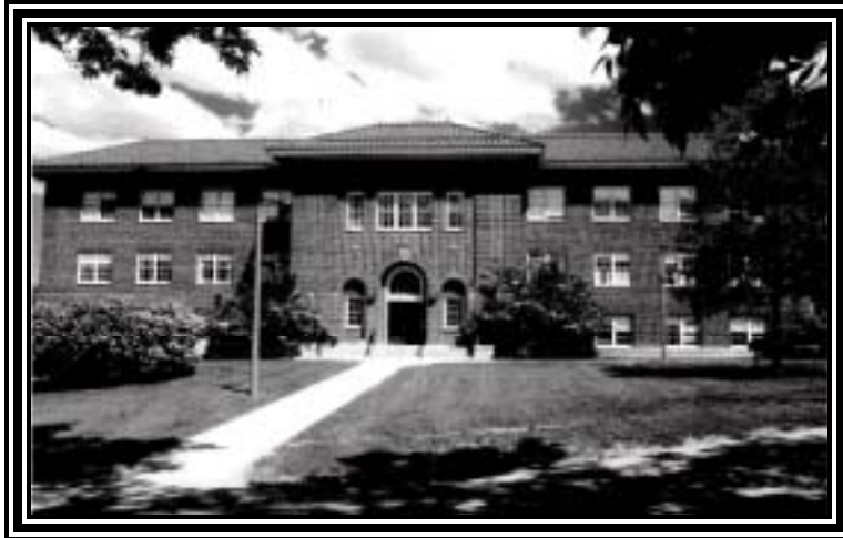
Herrick Hall – Constructed 1926 Health and Human Development Department Gross Area 40,400 s.f.