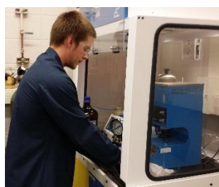
Figure 3. Synthesis of renewable high-octane chemicals

To justify that this novel process will be economically sound and environmentally friendly, the researchers have procured the necessary tools to conduct a comprehensive techno-economic and life cycle analyses. These tools are not only critical to this research but also relevant to integrating student education and real-world applications. MSUN students from agriculture and civil engineering department were employed to assist in data collection and analysis.