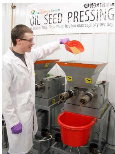
Figure 1. Camelina oil extraction.

With the steady decline of manufacturing employment in Montana and as the search for alternative energy sources continues, industrial oilseed crops pose a unique opportunity in addressing these issues. This collaborative research effort between Advanced Fuels Center, Montana State University-Northern (AFC-MSUN) and Montana State University Billings (MSUB) aims at establishing and maintaining a biorefinery utilizing Montana-grown industrial oilseed crops. If a local facility can process industrial oilseeds, such as camelina and carinata, and is able to pay producers a competitive price, there is potential for an oilseed-based biorefinery that will boost Montana's manufacturing employment and will meet industries' greener portfolio. The establishment of this biorefinery will provide sustainable growth in Montana's agriculture and manufacturing industry in two ways: [a] the research is expected to generate numerous Montana jobs and will allow the investment to be leveraged by attracting businesses and [b] the research can address the federal government's thrust of utilizing alternative energy sources to achieve a cleaner environment.