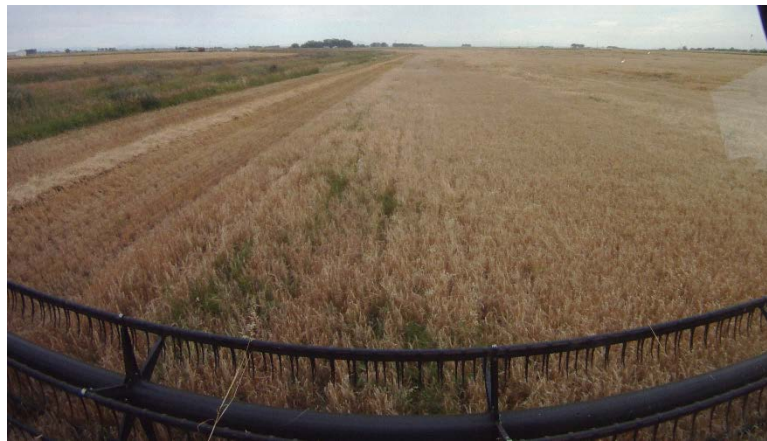
Figure 3. Photograph illustrating weeds embedded in grain during August 2015 harvest.