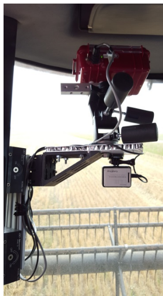
Figure 1. Photograph of a prototype spectral imager mounted in the cab of a combine during the August 2015 barley harvest at Nugent Farms in Fairfield, Montana.

Figures 1-3 are photographs from the August 2015 barley harvest at Nugent Farms in Fairfield, Montana. Figure 1 shows a prototype spectral imaging system mounted in the cab of a combine. Figure 2 is a wide-angle image of the combine seen from the front (the prototype spectral imager is in the cab, but is not noticeable in this image). Figure 3 is another photograph of the combine during harvest.