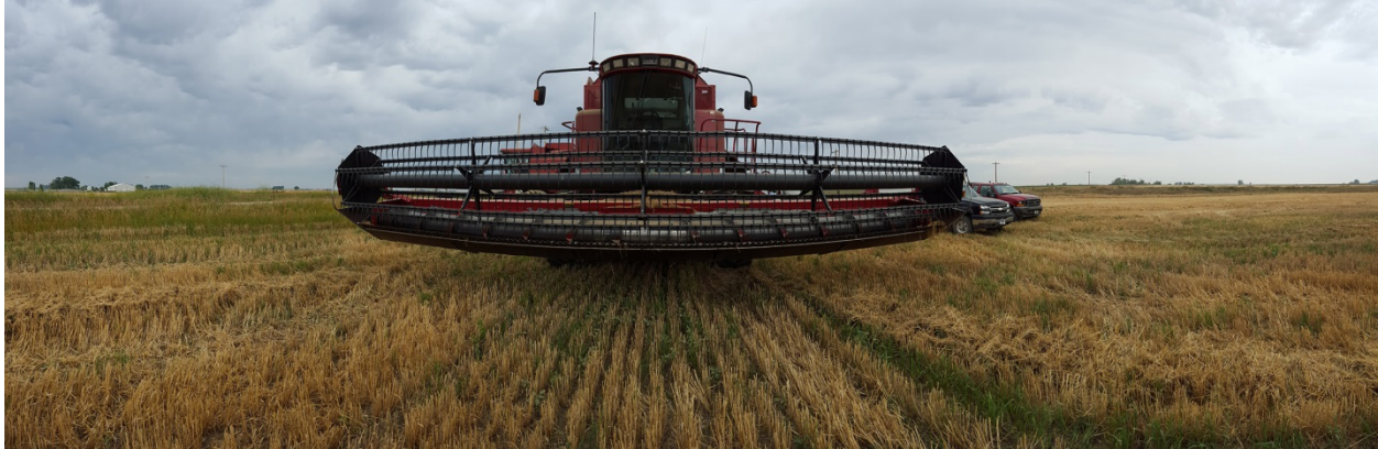
Figure 2. Wide-angle image of the combine during barley harvest at Nugent Farms in Fairfield, Montana.