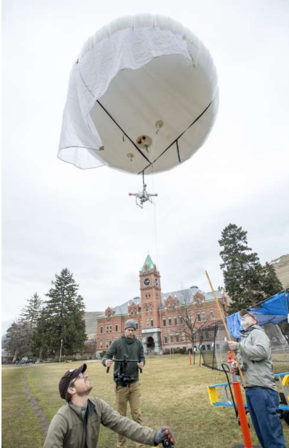
Students work with DJI Phantom suspended below balloon at UM 'fly-in' highlighting some of the current regulatory absurdities in UAS flight operations.