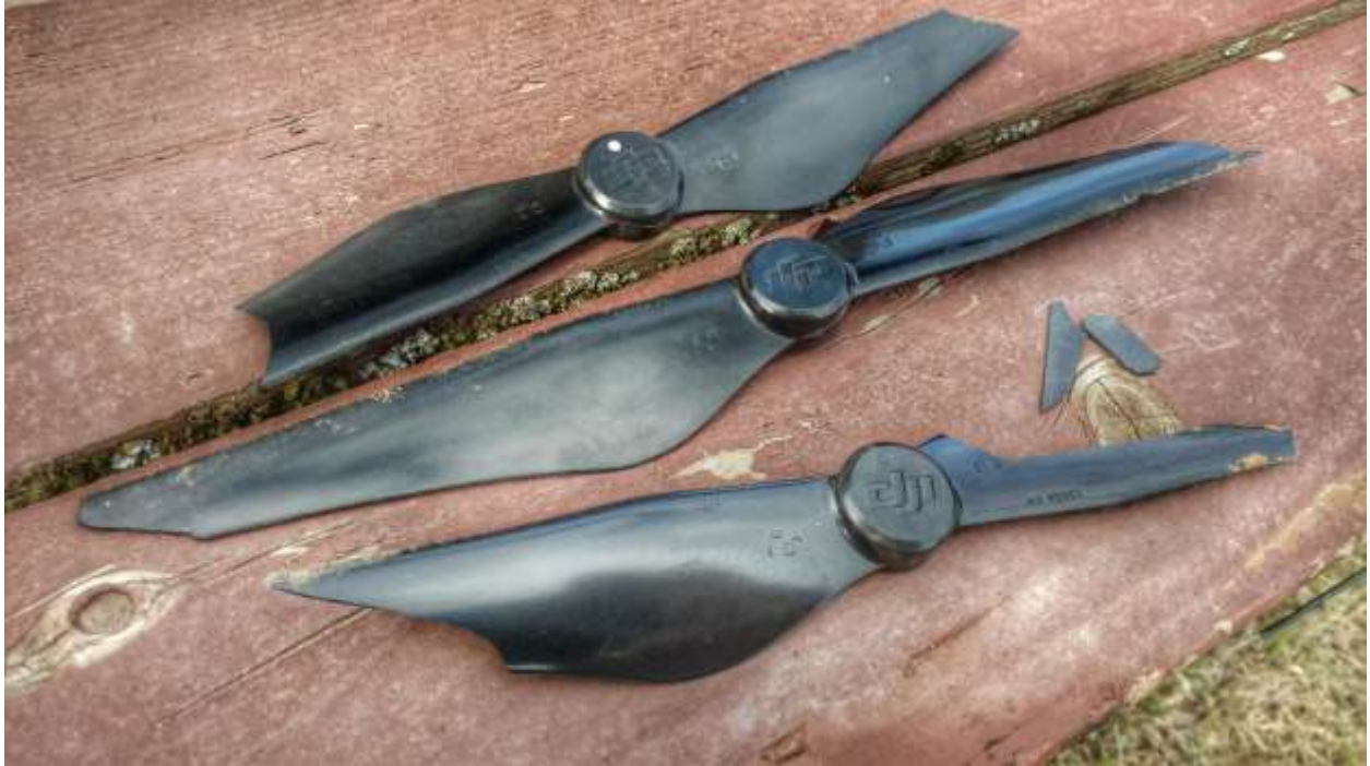
Steep learning curve - broken rotors after test-flight.