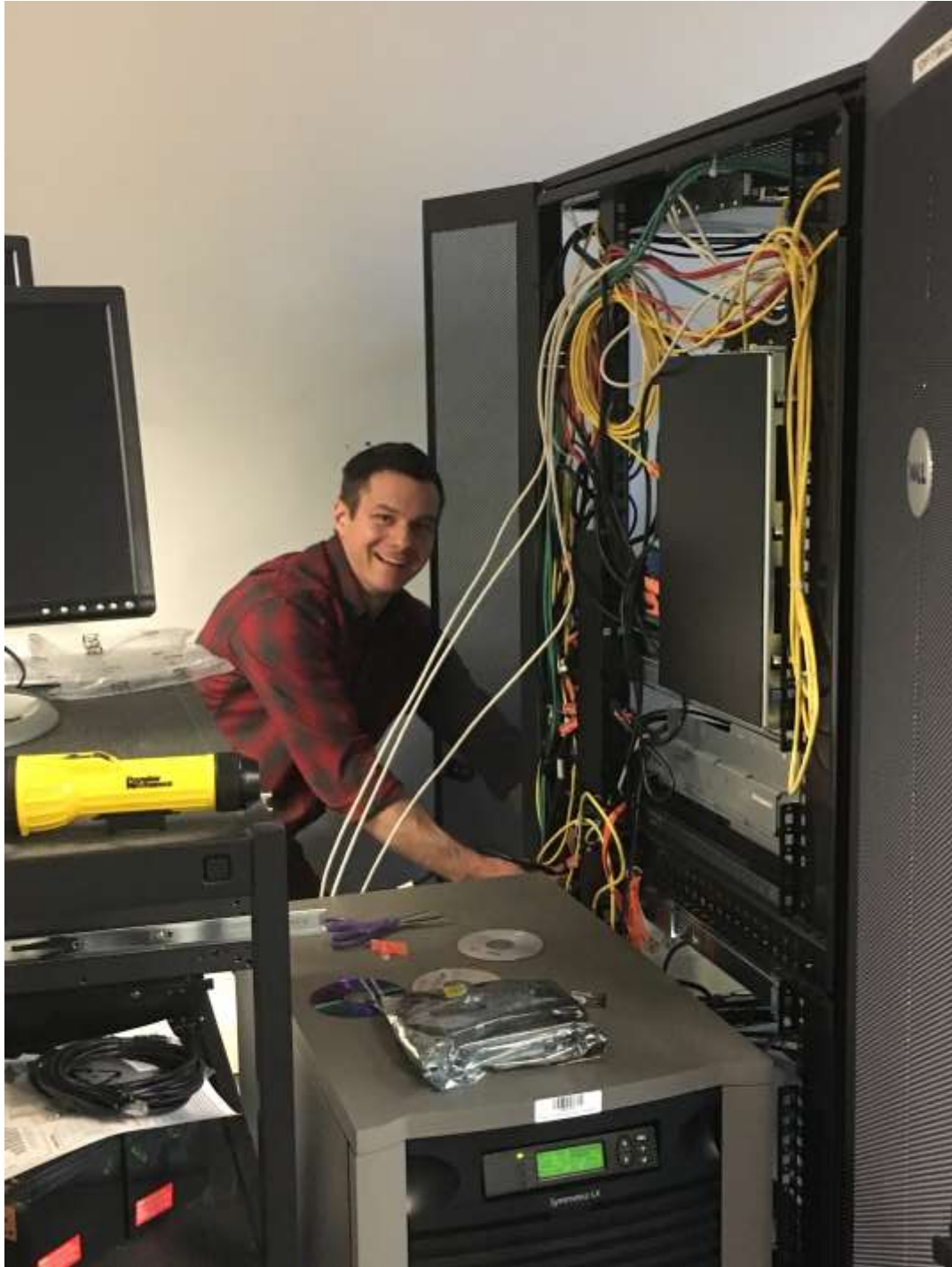
Configuring the cloud computing cluster at UM for DroneFire, March 2016.