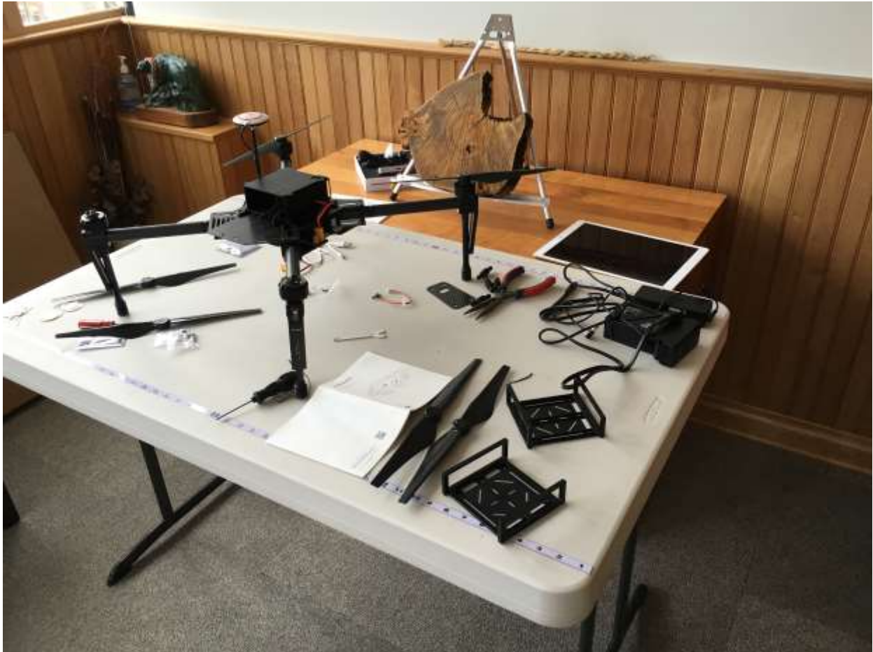
Assembling the Matrice100.