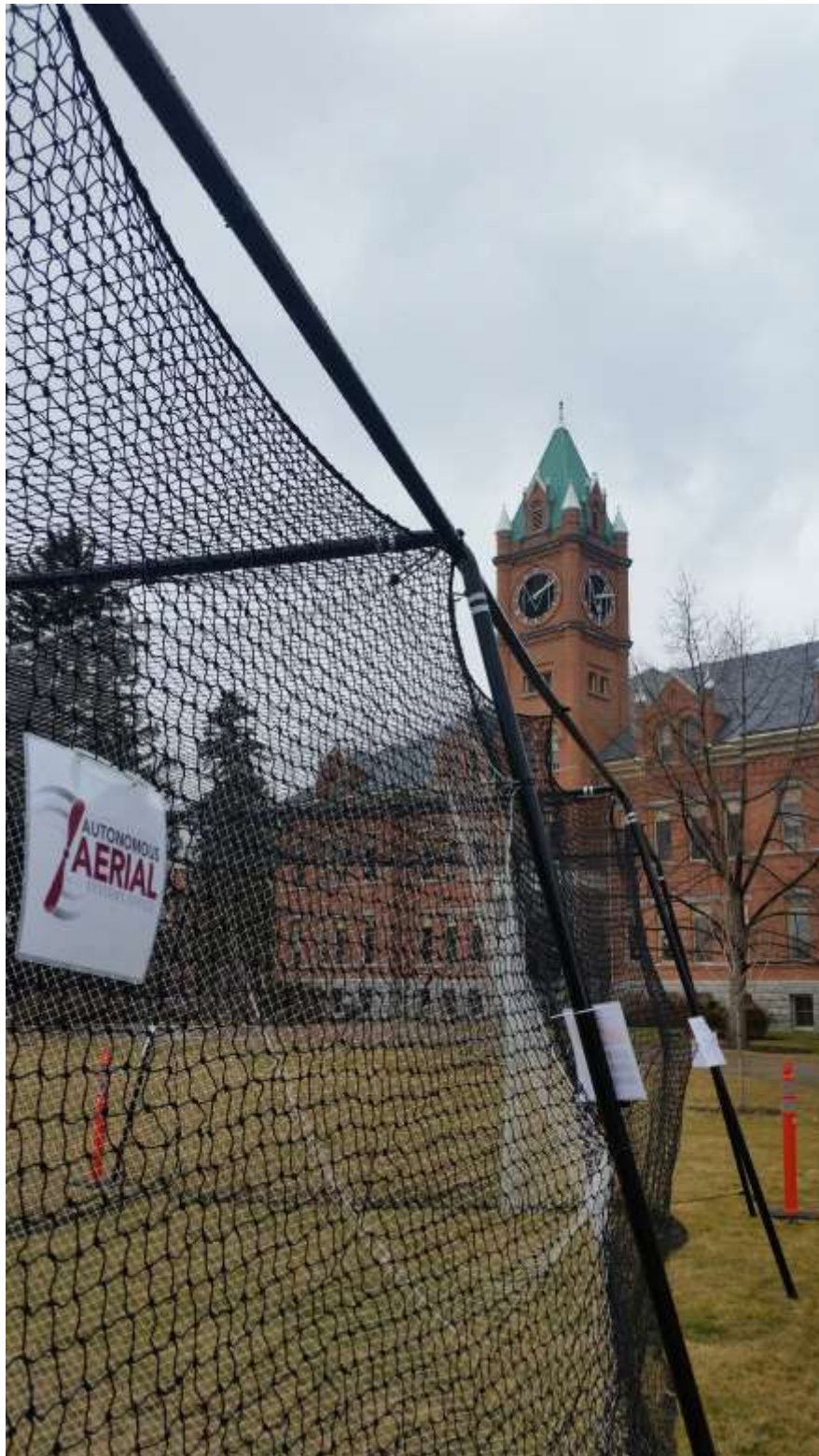
The practice flying net set up on the UM Oval.