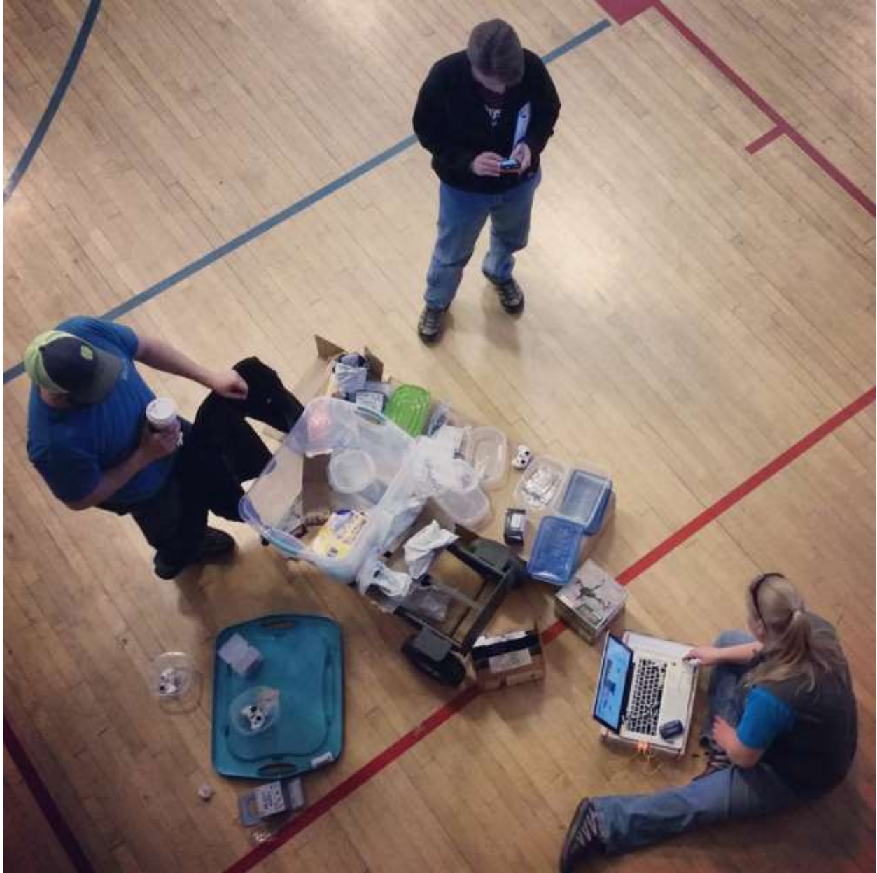
Testing and flying in UM's Schreiber Gym.