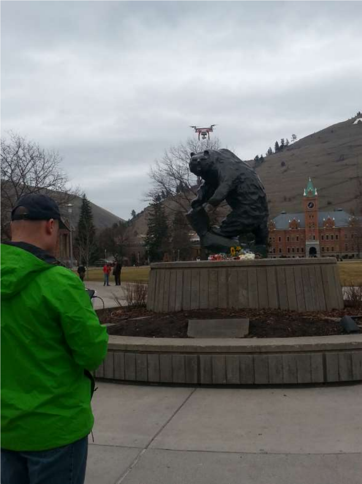
Recreational pilot flying DJI Phantom on UM oval at 'fly-in'.