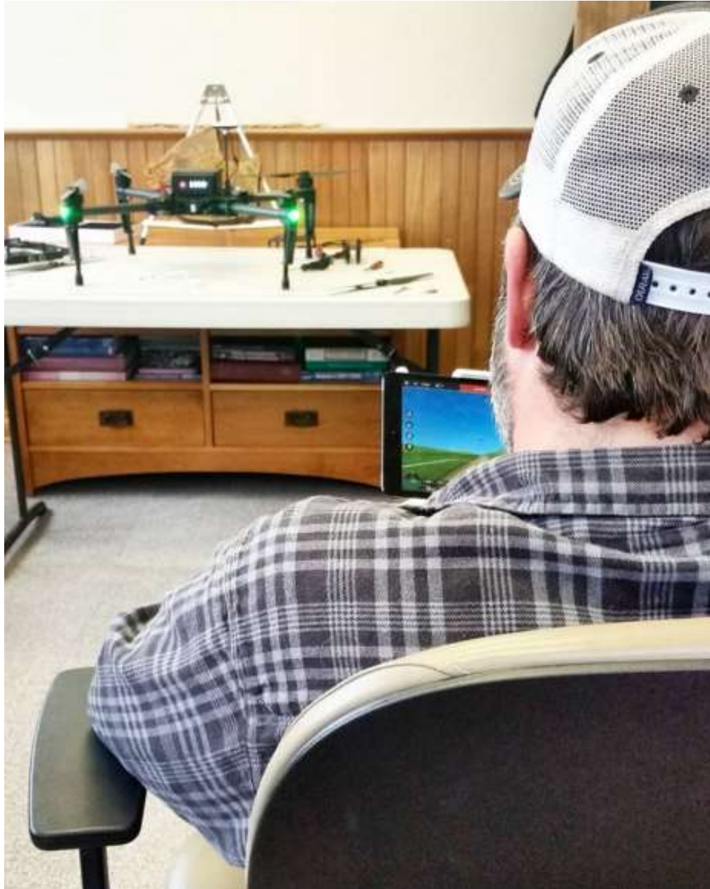
First Light- testing the DJI Matrice100 by lead pilot.