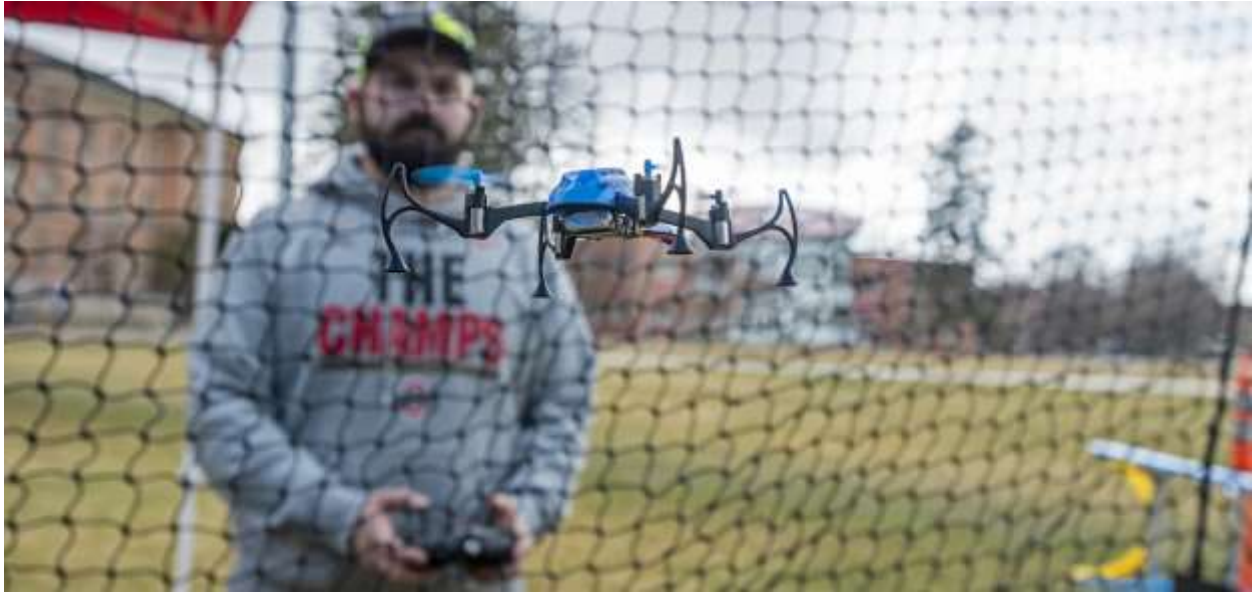
Student test-flying drone in net on UM oval