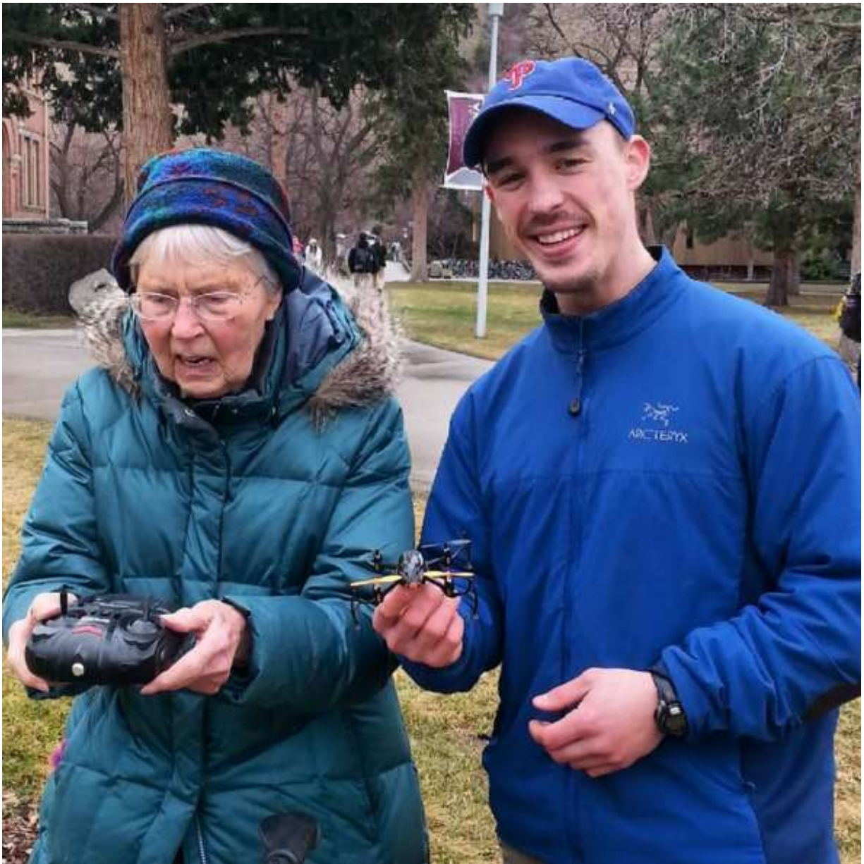
Student teaching citizen how to fly at UM 'fly-in'