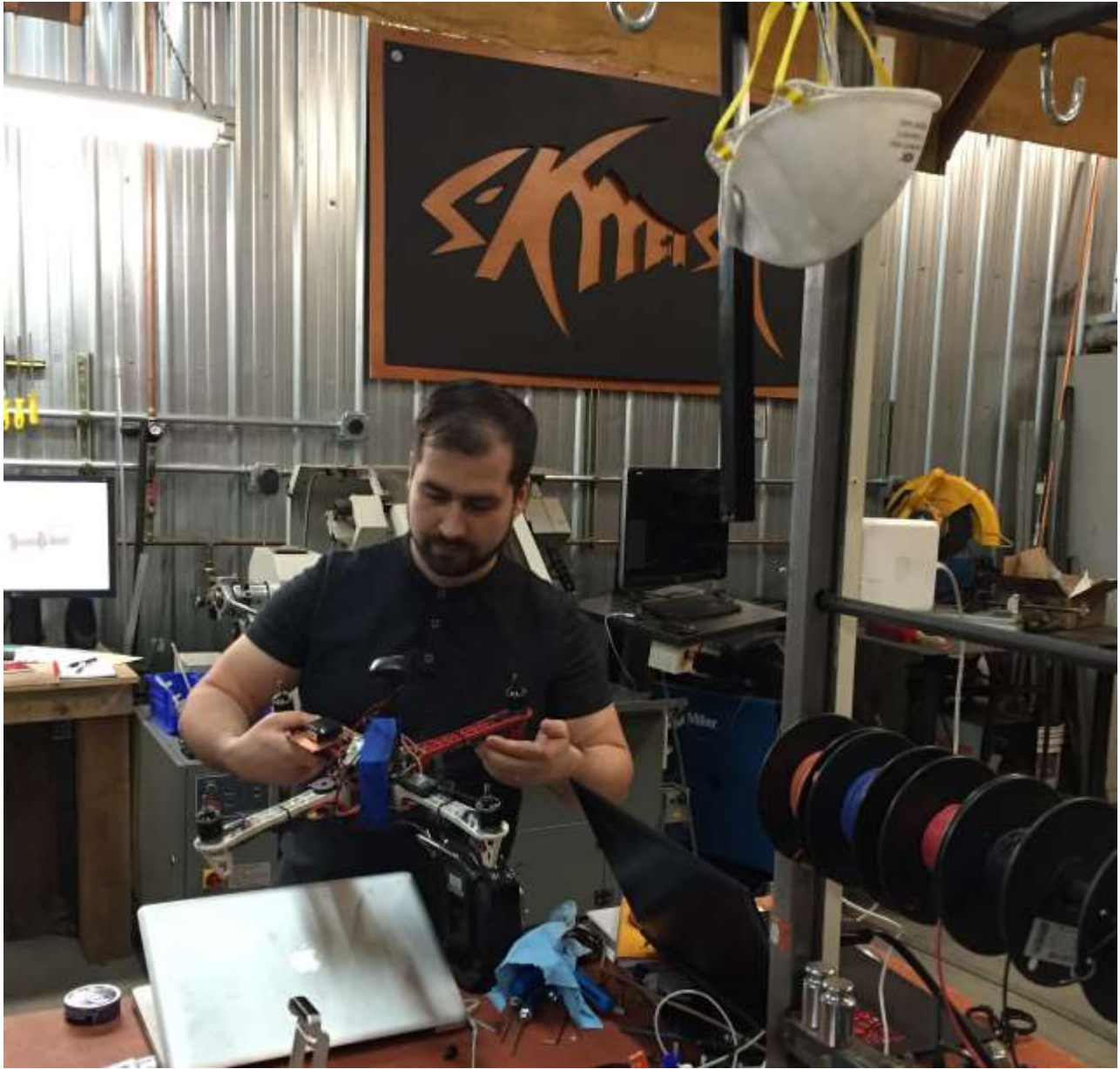
Skyfish engineer assembling drone at Missoula facility. Skyfish is a project partner in hardware/software manufacturer and integration.