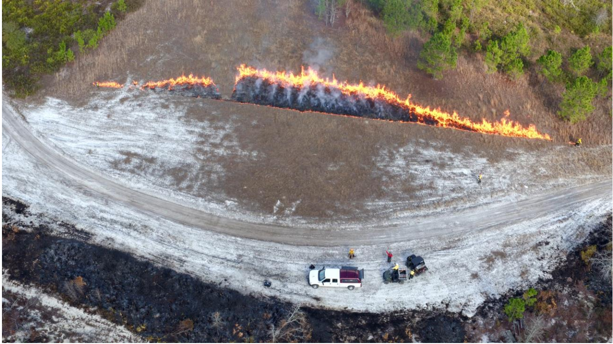
Researchers light ignition strip to carry fire into highly instrumented field plots. Drones are being used to characterize thermal energy from multiple look-angles and elevations.