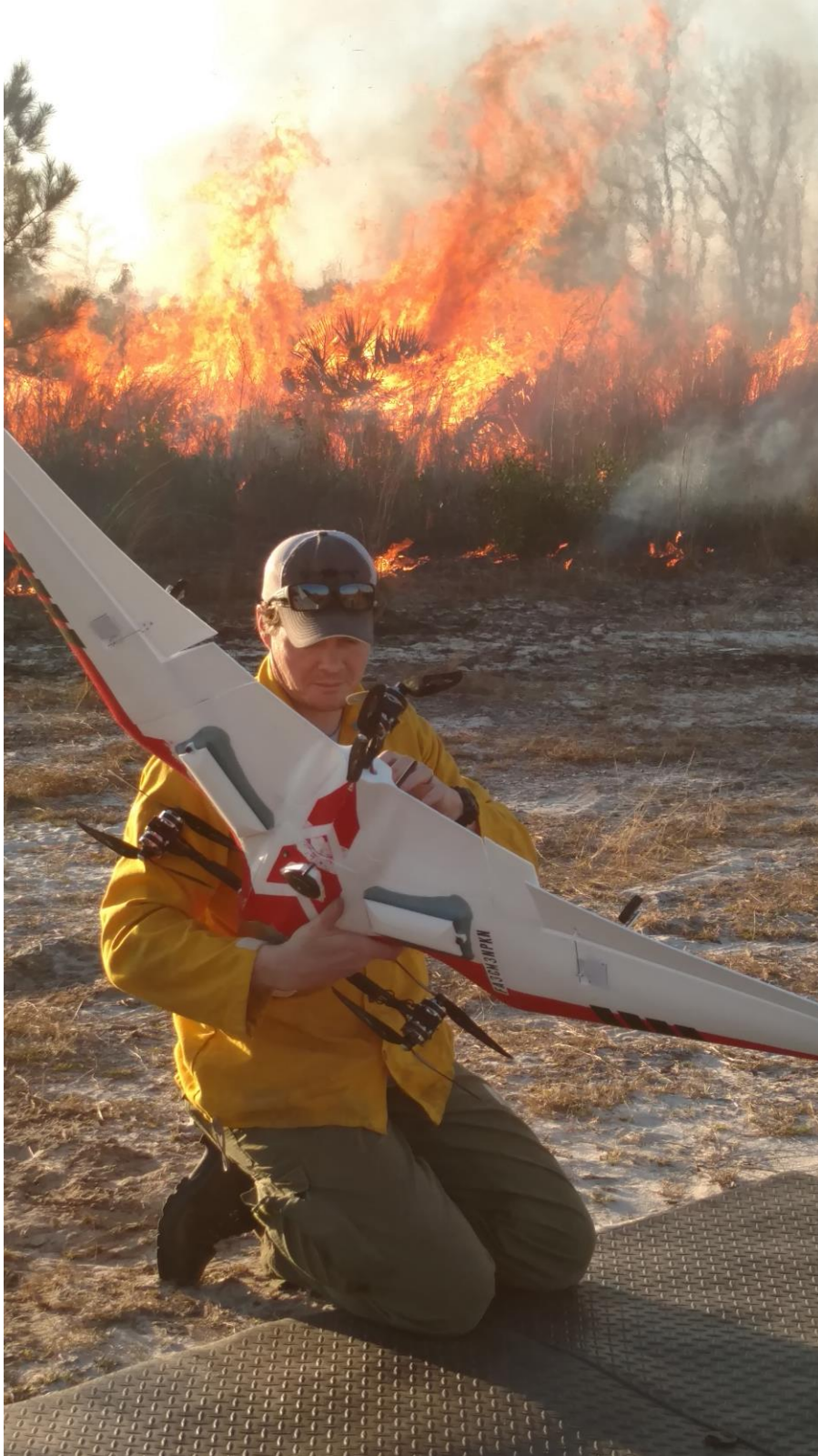
DroneFire technician preparing vertol FF6 platform for launch on prescribed fire in Georgia.