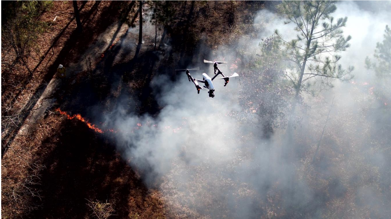
Drone with thermal camera hovering over field plot.