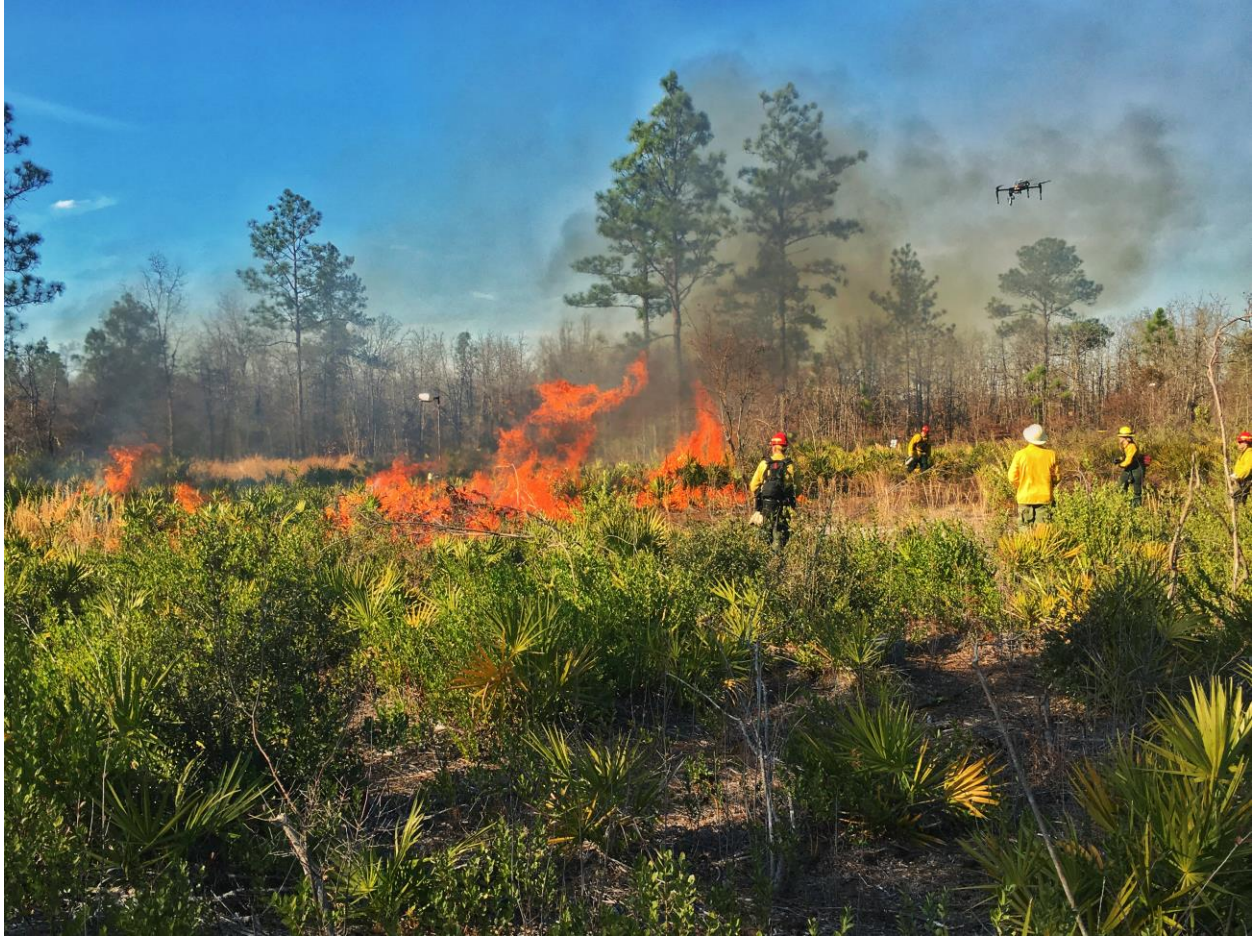
Researchers collecting coincident in situ and drone-based thermal data. Sensors in the fire are being used to calibrate thermal imagery from the drones.