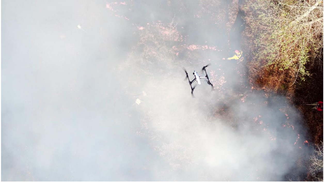
Drone and firefighter.