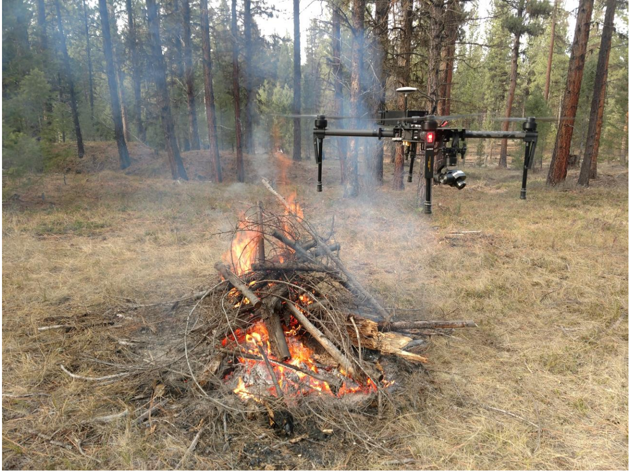
Calibrating thermal camera on burning slash piles at Lubrecht Experimental Forest.